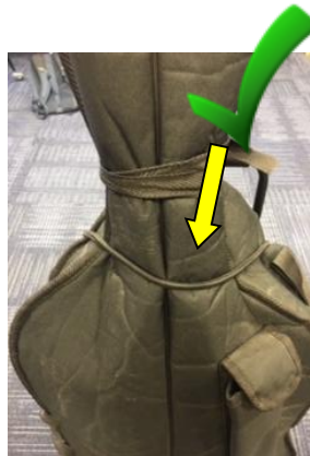
Figure 3: This bass is securely strapped in to the cart without any squeezing. The bungee is over the shoulders of the bass.