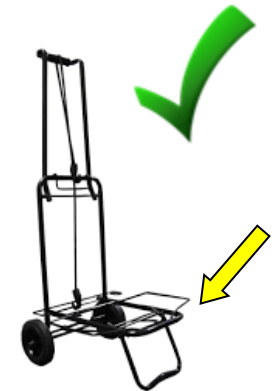
Figure 6: This cart has a bar across the front to secure the endpin.