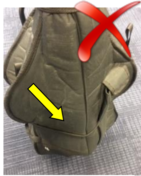
Figure 1: DANGER! The bungee is too tight and may be pushing on the bridge.