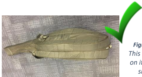
Figure 8: This bass is on its safe side.