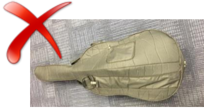
Figure 7: DANGER! This is not the safe side! Do not store a bass on its back!