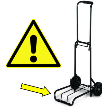
Figure 5: DANGER! The endpin might slide out the front of this cart! If using a cart like this, an additional bungee across the lower bouts is recommended.