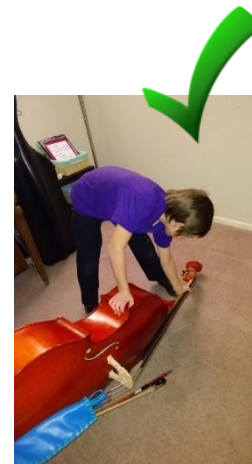
Figure 12: This student is demonstrating proper hand placement when picking up a double bass.