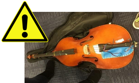
Figure 9: While packing up your bass or in the car while driving is the only time your bass should be on its back.