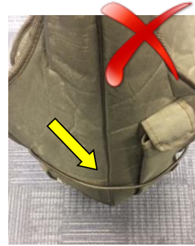
Figure 2: DANGER! The bungee is too loose and improperly placed. The bass might fall off the cart while you are rolling it!