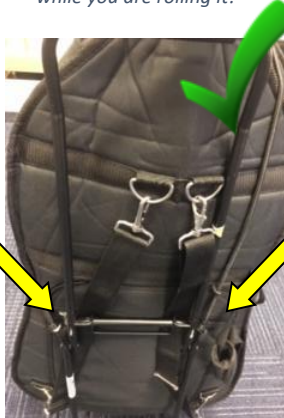
Figure 4: Notice how the bungee is attached to a part of the cart that does not move or fold.